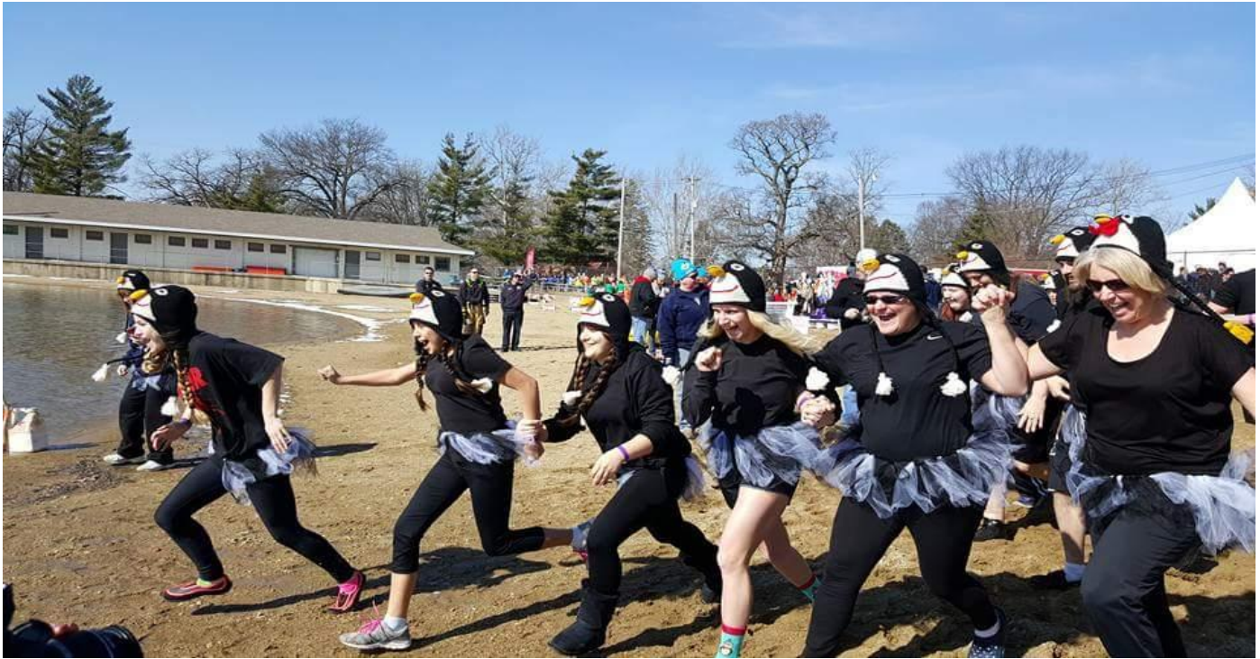
Pontiac Plunging Penguins had a great time participating in the Illinois Special Olympics Polar Plunge.